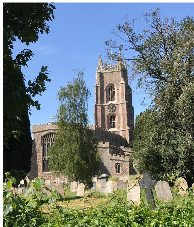
The view from 3 Rowley Cottages